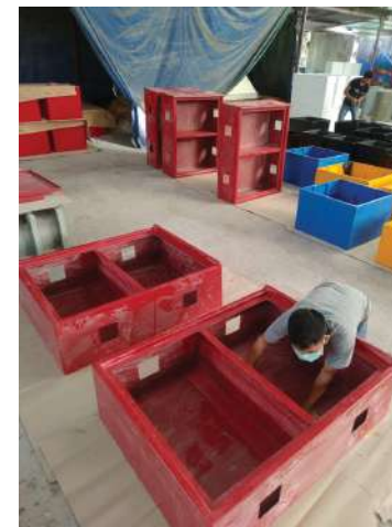
FRP Offshore Cabinet