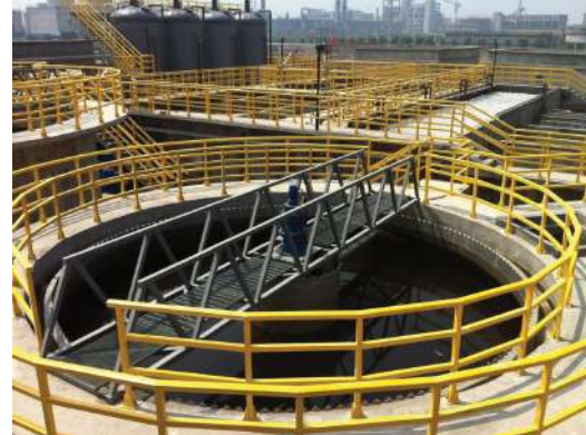
FRP Building Material Handrail