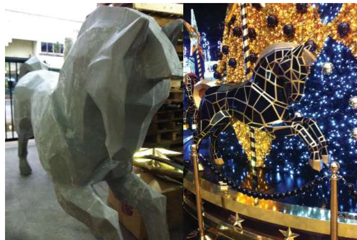
Fiberglass Horse Statue