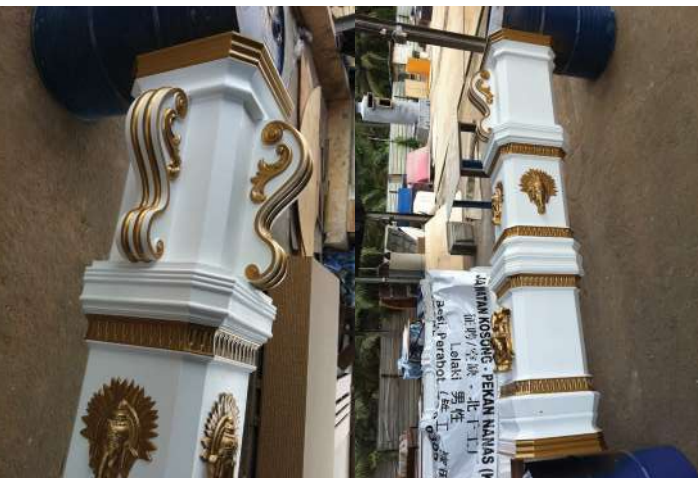
Fiberglass Artistic Beam